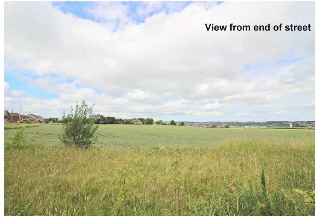
View from end of street